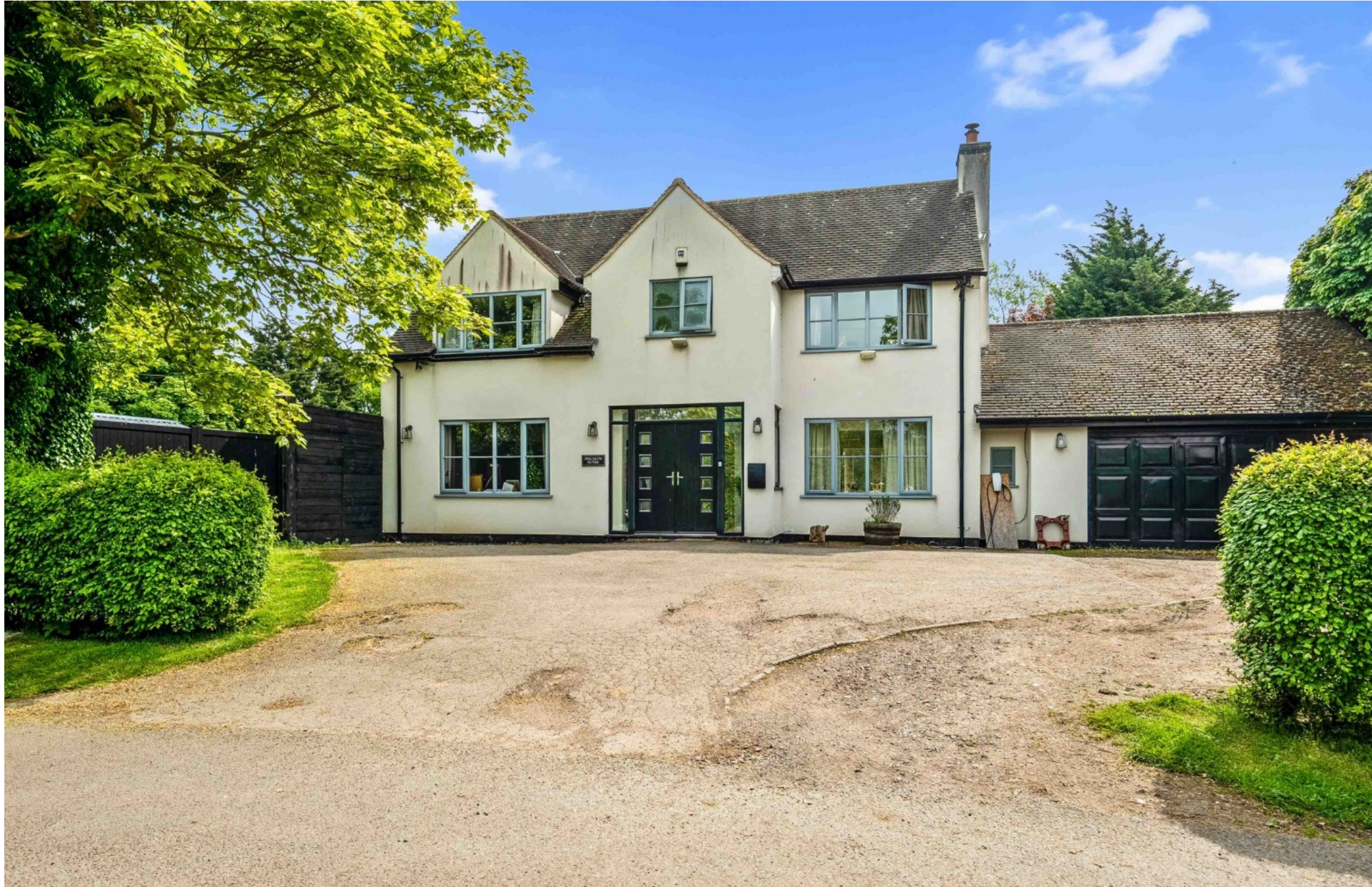
BRICKLYN HOUSE, BULLS LANE, WISHAW, B76 9QN